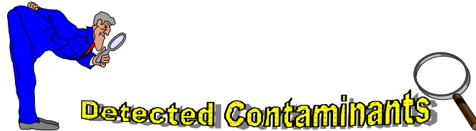
Table 1. 2014 Nitrate and DBP contaminants detected from Payless Super Mart .

Payless Super Mart did all the Total Coliform testing requirements for 2014 and obtained no MCL violation. Nitrate monitoring requirement was collected on October 15, 2014 at the Entry Point (21401). We also did the monitoring for Total Trihalomethanes and Haloacetic Acids (TTHM & HAA5) on November 17, 2014 collected from a five gallon bottled water. Five Lead & Copper (Pb & Cu) samples were also collected at 4 refilling stations (21401 to 21404) on November 5, 2014. Results for these contaminants show that no MCL was detected (see table 1 & 2 below).